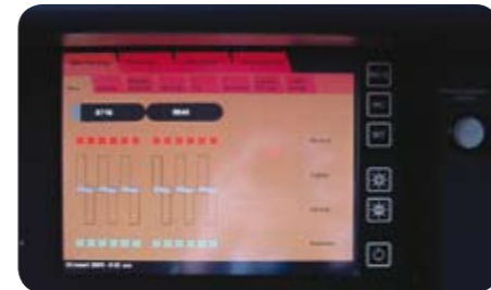
Maintenance screen Train

POSS ® satisfies all modern railway requirements, complying with the highest electromagnetic compatibility (EMC) standards in its category and is therefore ideal for all rail infrastructure applications.