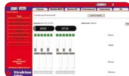
Maintenance screen POSS ®